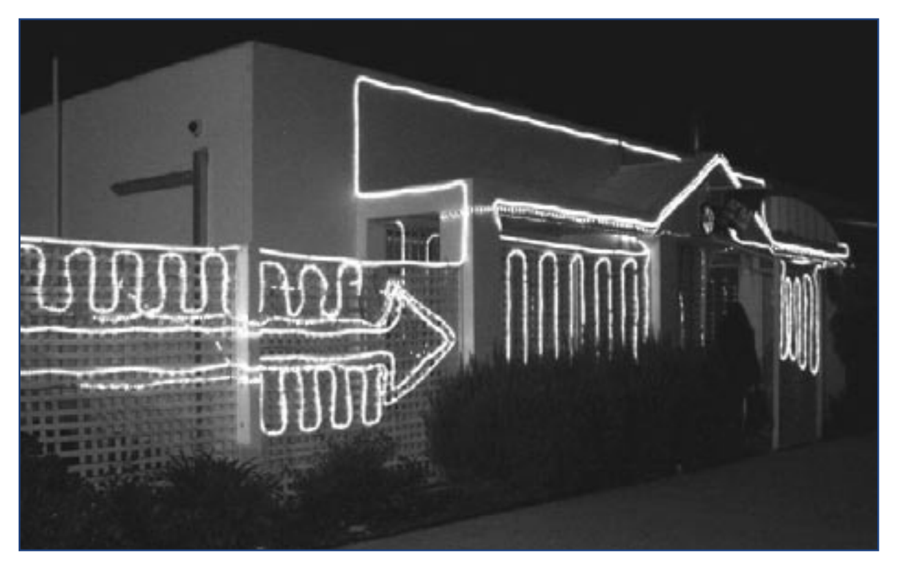
Figure 3 A Perth brothel in 2007