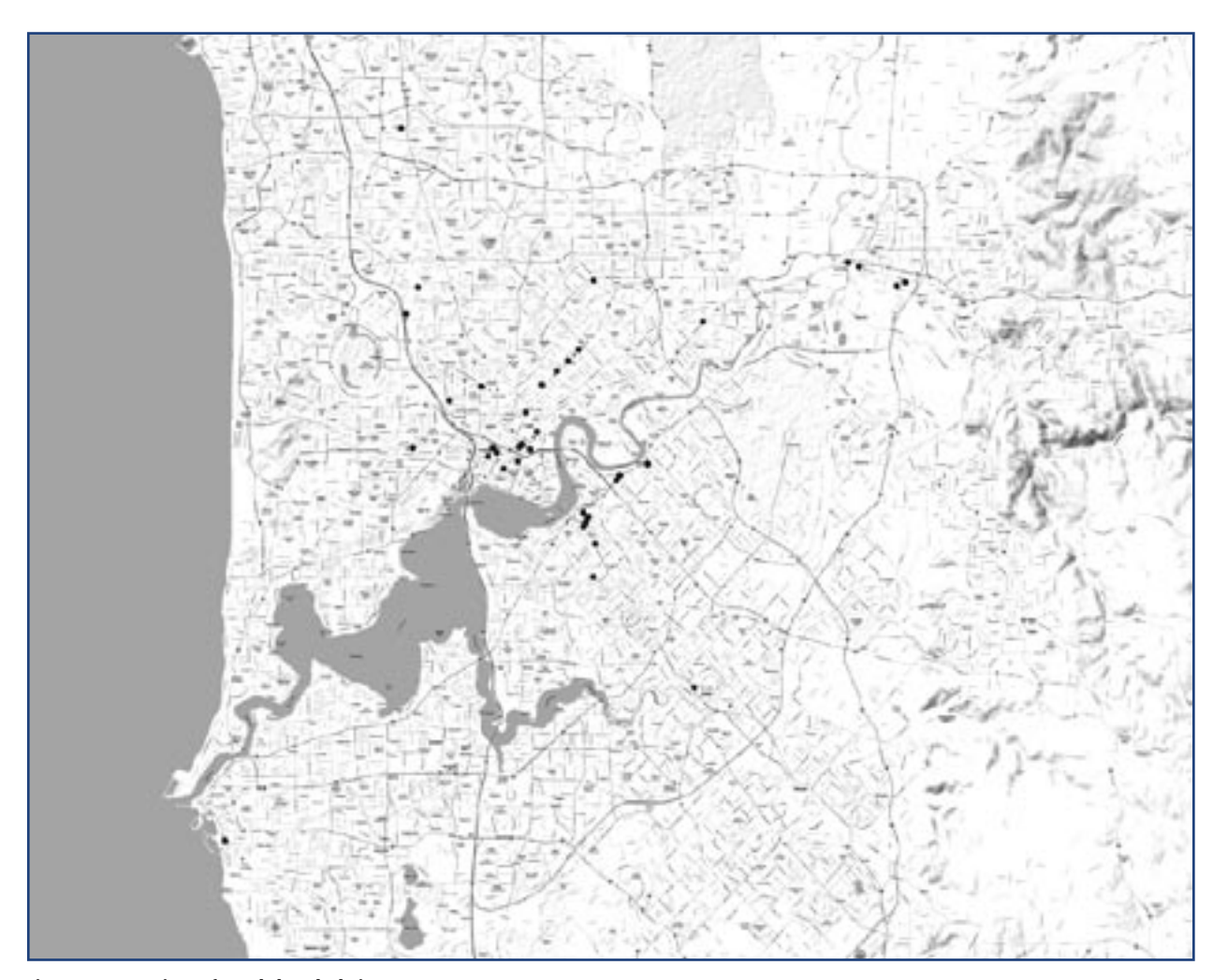
Figure 2 Location of Perth brothels in 2007